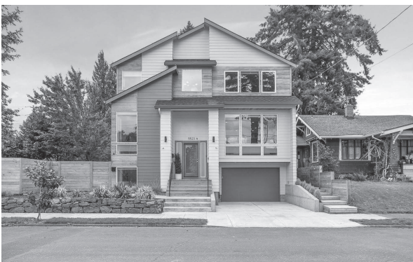
5523 N ATLANTIC AVE Portland, OR 97217 Sold for $940,000