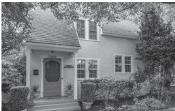
7666 N ALBINA AVE Portland, OR 97217 Sold for $559,000