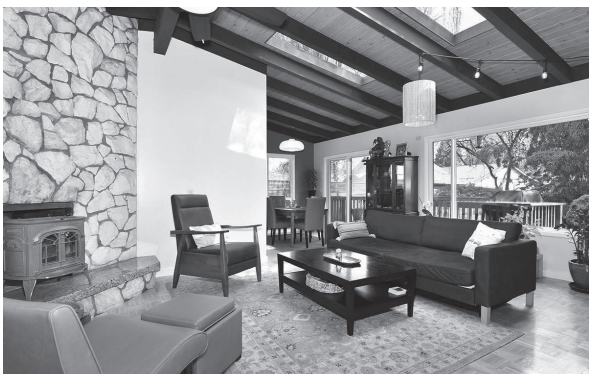
9504 N CLARENDON AVE Portland, OR 97203 Sold for $675,000