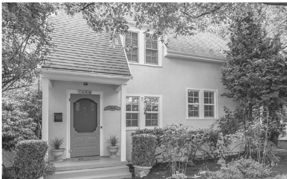
7666 N ALBINA AVE Portland, OR 97217 Sold for $559,000