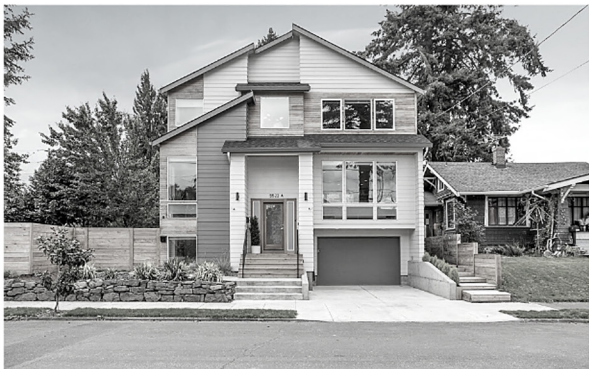
5523 N ATLANTIC AVE Portland, OR 97217 Sold for $940,000