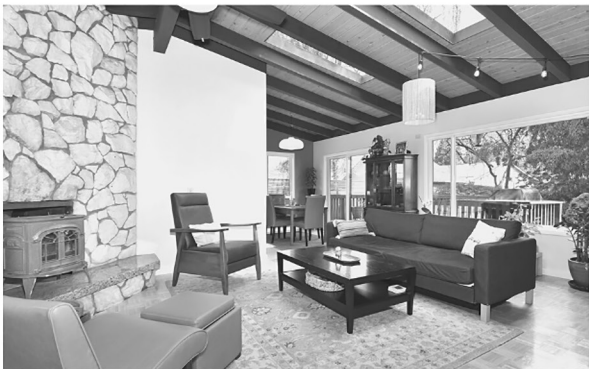
9504 N CLARENDON AVE Portland, OR 97203 Sold for $675,000