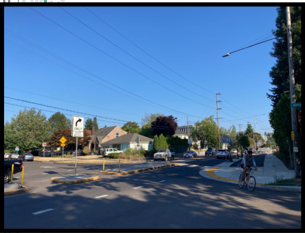
Use the median island at N Willamette Blvd to transition to the two-way cycle track on the west side of N Greeley Ave.