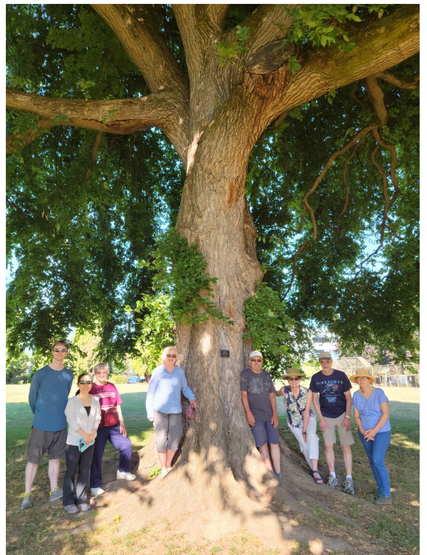
The Overlook Park Heritage Tree Celebration

These bike rides will be a fun way to get some exercise, visit some North Portland neighborhoods, learn something new about trees and meet some new people. Try it, you may like it!