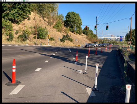
Just south of N Going St, cyclists transition from the