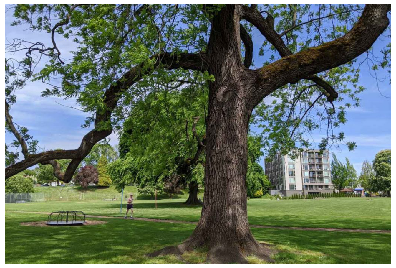
A runner enjoys the trail through Overlook Park.

They welcome you to visit their new website, discover new parks and natural areas, give them feedback, attend one of their meetings, and sign up for their occasional emails and updates. Just go to northportlandparksadvisorygroup.org.