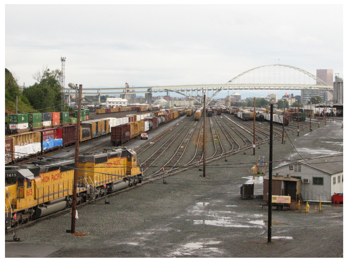
Union Pacific's Albina Yard looking south taken in 2019.

In addition to the VOC pollution, according to the 2014 Environmental Protection Agency National Air Toxics Assessment released in 2018, Portland ranks in the worst 1.3 percent of communities for diesel particulate exposure, an airborne carcinogen. Many unfiltered diesel trucks pass through Overlook and North Portland on the way to the Swan Island and Alibna Yard areas. The Oregon Department of Transportation reports that the Albina Yard generates the greatest number of truck trips.