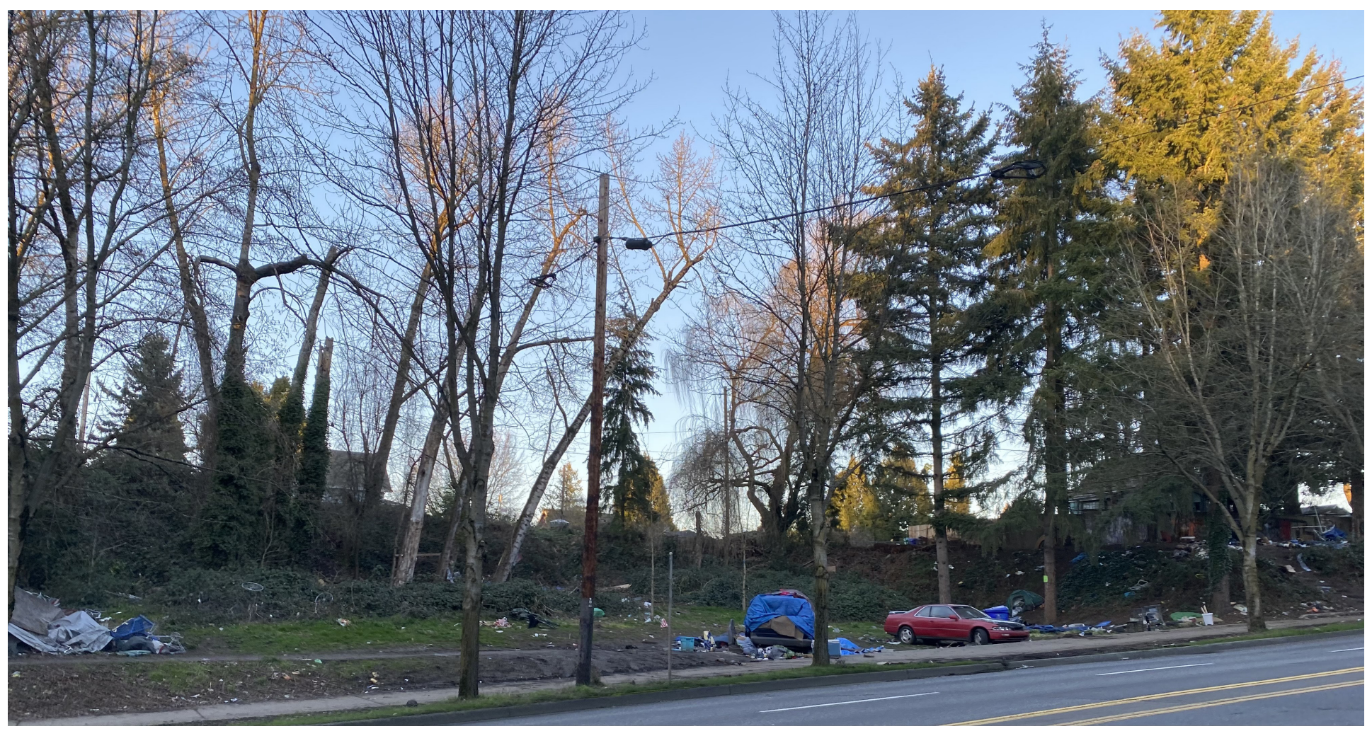
Homeless camping along N Going Street.

Homelessness continues to be an extremely complex and challenging issue affecting many Oregonians, including the residents of the Overlook Neighborhood. According to a November 2020 research study conducted by Portland-based DHM Research, one in two Oregonians (50%) believe it is either very important (28%) or urgent (22%) that leaders in their community make solving homelessness their number one priority.