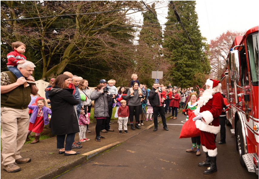
Families greet Santa Claus as he arrives at the Historic Overlook House by fire truck.

Friends will provide updated information about the Santa Visit on its online calendar, part of a newly designed website at historicoverlookhouse.org . It also will share updates on social media channels as the date approaches and will also communicate via our social media channels as the date approaches. (@historicoverlookhouse on Instagram and Facebook.)