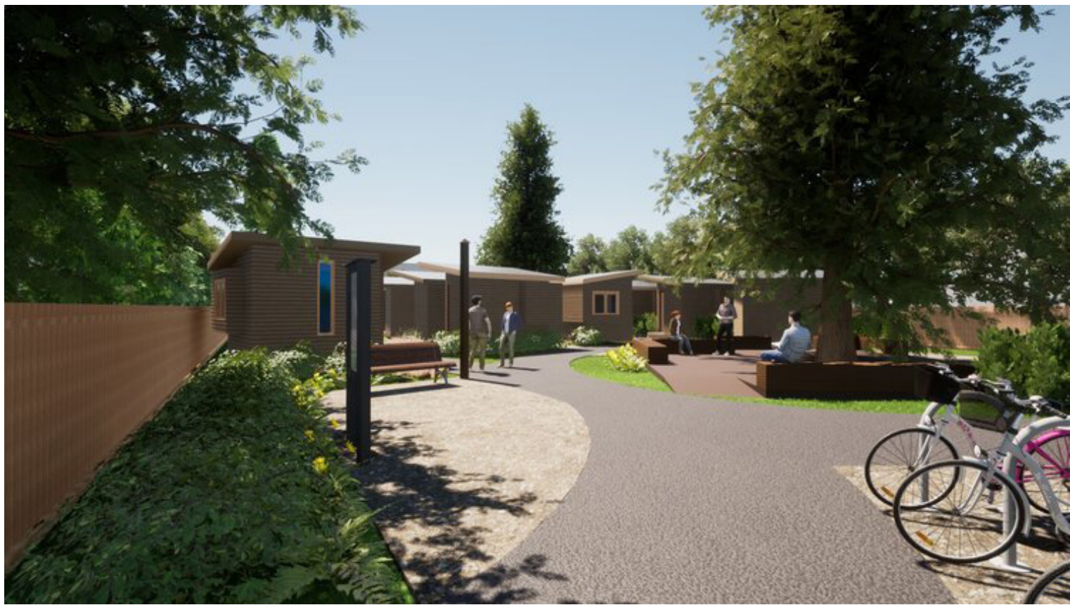
A nearly complete rendering of the St. Johns Village show what pods, pathways, landscaping and community space will look like when it opens.

Residents of the Hazelnut Grove homeless camp will soon have new places to live. The St. Johns Village is on track to open by the end of the year, and Hazelnut Grove campers will have the first opportunity to move there. Soon after, the illegal campsite that Hazelnut Grove occupies in Overlook will close.