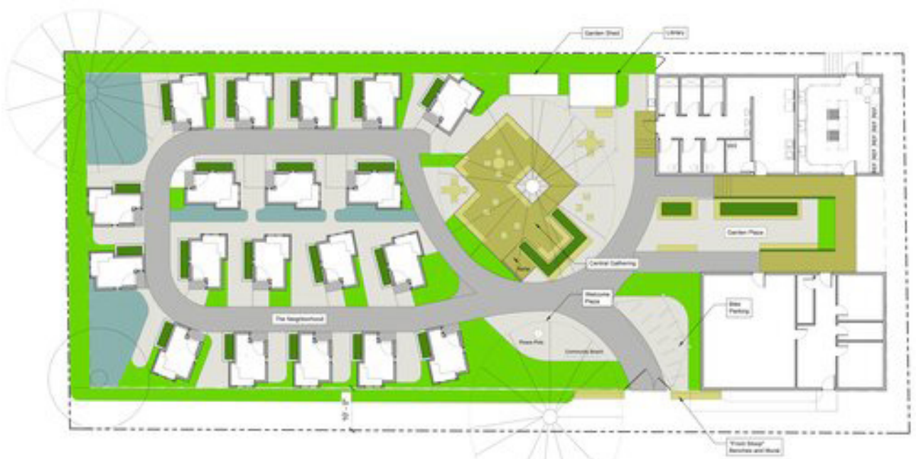
Site plan for the St. Johns Village.

A group called St. Johns Welcomes the Village Coalition has formed to support the new community. “We are committed to working together with project stakeholders and all neighbors to ensure the village is a success and an asset in our community,” the group noted in an open letter.