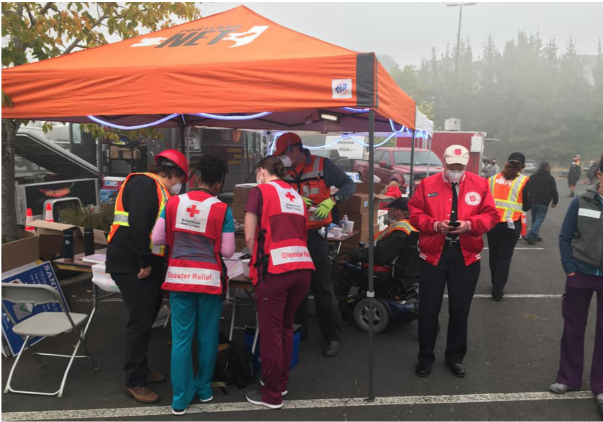
NET teams respond to wildfires in Oregon this summer.

For years, Overlook NETs have been preparing themselves and their neighbors to survive The Big One, the 9.0 Cascadia Subduction Zone earthquake expected to happen any time now, give or take 100 years. They encouraged neighbors to have emergency supplies on hand, including 72 hours worth of water and food. They’ve also mapped the neighborhood, connected neighbors and gotten themselves ready for a major earthquake. Then COVID-19 happened.