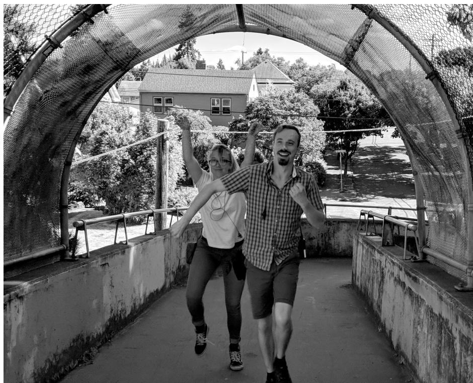
Production assistants pose as the main characters of Timmy Failure during test shoots at the pedestrian footbridge over N Going Street.

If you encounter a film crew from this production, please be respectful and welcoming while they work.