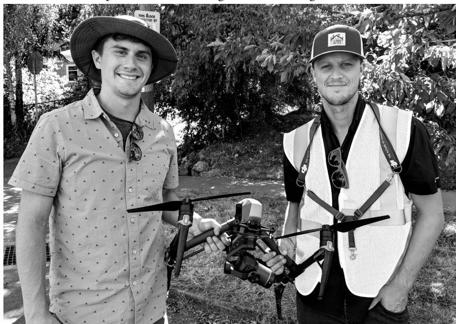
Drone operators from Aerobo hold the drone that will capture aerial footage for the movie.