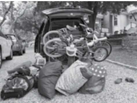
"Hey bad guys! Come rob our house!"