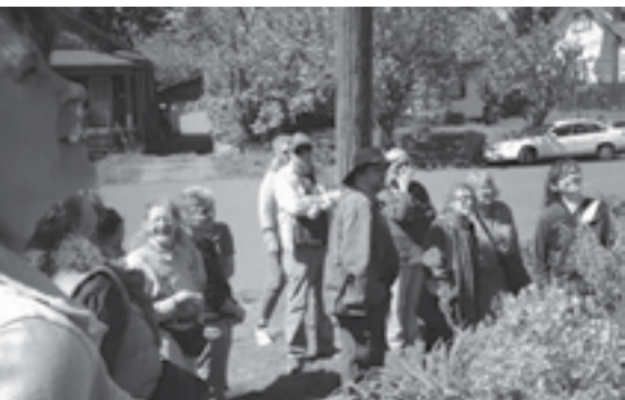
Garden tour-goers admire a pesticide-free food and habitat garden