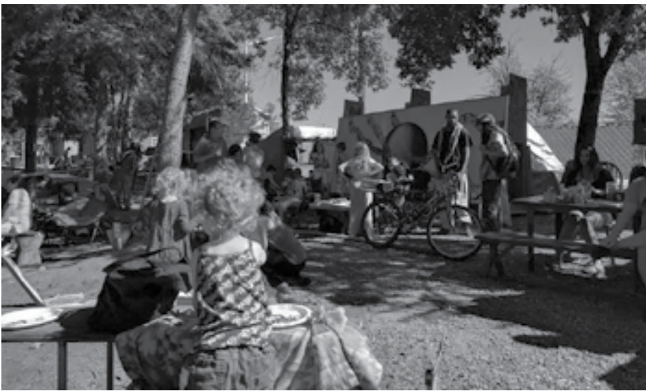
“Hazelnut Grove’s “Groove at the Grove” event drew visitors to the camp for music, food and discussion on July 23.”