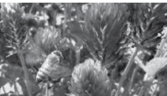
Honey bee on Crimson clover cover crop