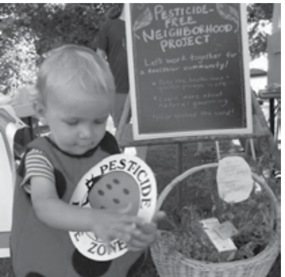
A lady bug helper at the Sustainable Overlook table at Movies in the Park.