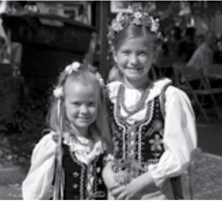
"Cute As Cute Can Be"

Prices continue to rise in the Portland metro area. Comparing 2016 to 2015 through June, the average sale price rose 11.8% from $347,900 to $388,800. In the same comparison, the median sale price rose 13.3% from $300,000 to $339,900. For more information on current market conditions please contact your neighbor and Realtor Emily Ordas. Contact info below.