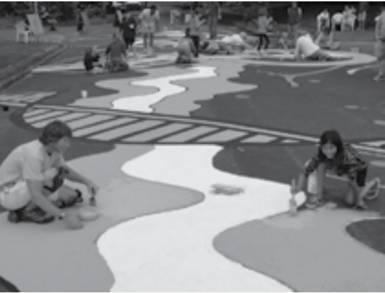
Neighbors painting the street mural at the 2012 Overlook Blvd. Intersection Repair, part of the Village Building Convergence.