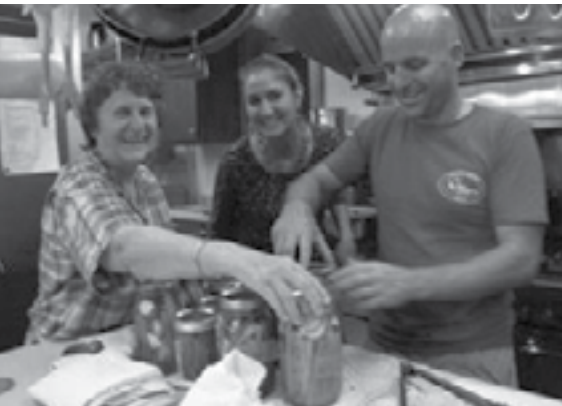
Food preservation workshop held at Daybreak CoHousing