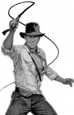
A Special Appearance?

Yes, I know that’s Labor Day weekend and you were thinking of leaving town so you and the kids could have one last summer trip before they go back to school. However, I can promise that our film extravaganza will be worth returning early or staying home for altogether. Neighbors are still talking about how much fun they had last year at our E.T. movie event.