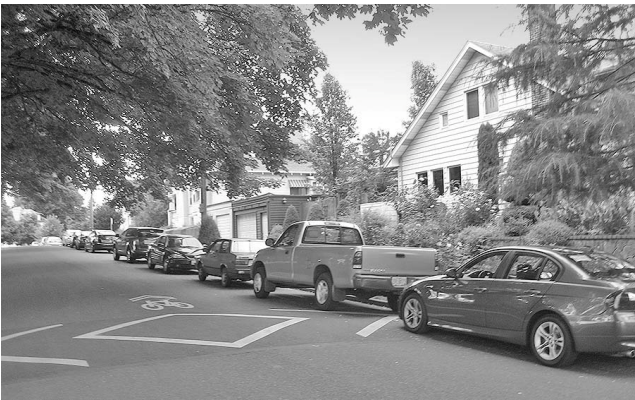
N Overlook Blvd, near N Interstate Avenue already has tight parking days.