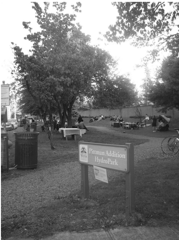
Merrymaking and relaxing in the new park