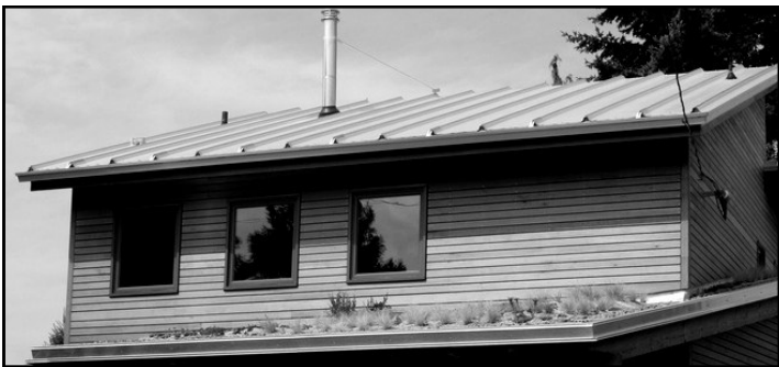
An eco roof is just one of the green features you can adopt.

“Our house was a community effort in more ways than one,” said Omeý. “Our friends and neighbors