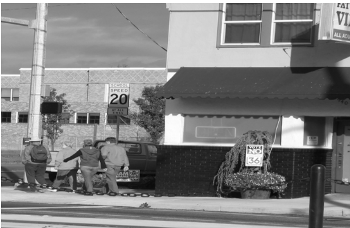
Ockley Green Foot Patrol Finishing a Shift

For more information contact this newsletter or an OKNA board member, or email ockleysafe@earthlink.net .